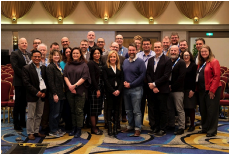
ICANN 64 Middle East Space Session