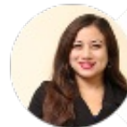
Latin America – Caribbean: Jenifer Lopez