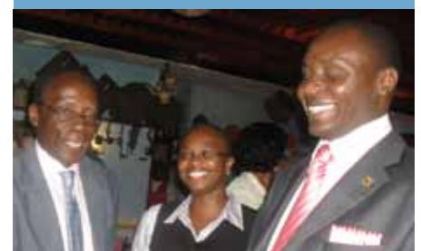
Special outreach event, @ IGF in Nairobi, September 2011