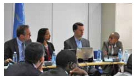
BC members @ IGF 2011 in NAIROBI Kenya