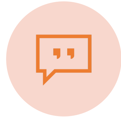
LEVEL 3: CONSULTATION, EXTENSIVE DISCUSSION