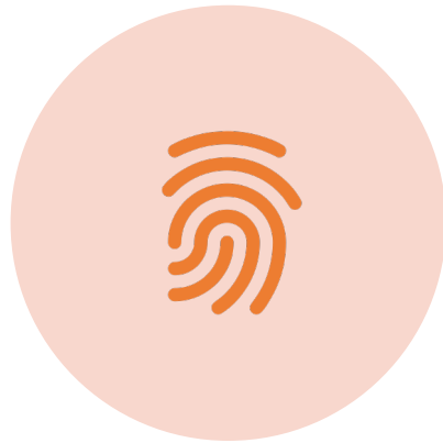
LEVEL 1: PRESENTING & REPORTING