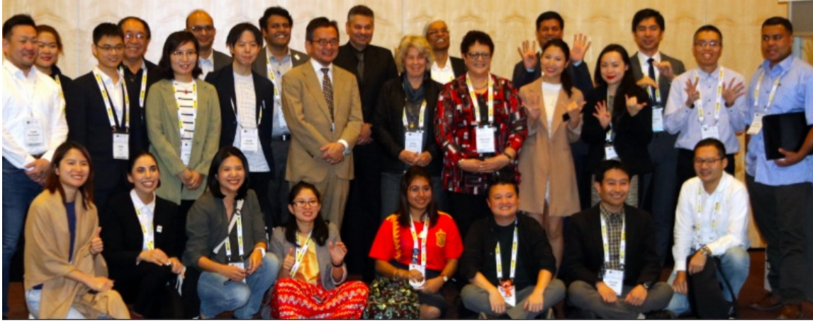
APRALO members at ICANN63, October 2018

The APRALO monthly call was held on 22 November, where there was a discussion regarding the At-Large Review Implementation (ARIWG.), as well as updates of the ALAC policy activities, Outreach & Engagement activities being planned for ICANN64 Community Forum in Kobe, Japan, Social Media Working Group updates, and reports from IGF 2018 and ICANN63.