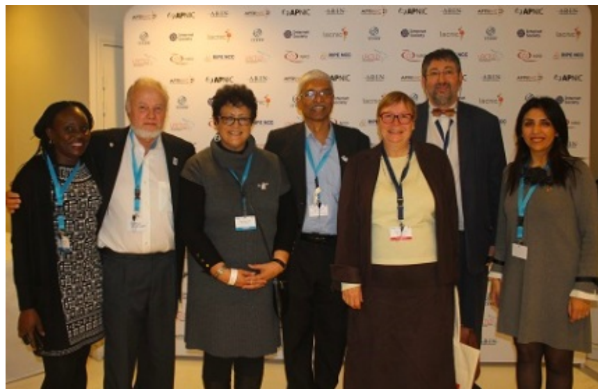
At-Large @ IGF 2018.