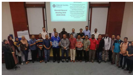
ISOC MY Biennial GM 2018

The first session of the workshop was a presentation on Internet ecosystem and the Internet , whereby the youth were introduced to Internet Governance and the various organizations who are involved including ISOC, ICANN and events; IGF, APSIG and APriGF. The second session was a Fishbowl which discussed a case study of Youth on the table. Both the sessions were greatly appreciated by the participants. For more details view the workshop report and video .