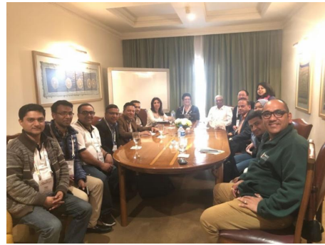
Pic: ALS Meet @ Kathmandu

This meeting was also attended by ALS representatives from India and Malaysia and also individual interested participants.