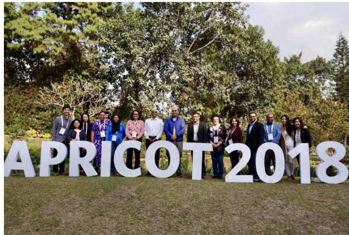
Pic: APRALO @ APRICOT 2018