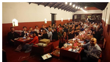
Pic: DotAsia 10th Anniversary Dinner

Longstanding Partner DotAsia Organisation hosted another warm and welcoming 10th Anniversary Dinner for their members, partners, and the ICANN Asia Pacific GAC members participating in the underserved region capacity building workshop at the APRICOT 2018 meeting, at Kathmandu, Nepal on 24 February,