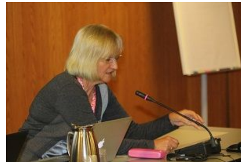
Gunela Astbrink (AP)