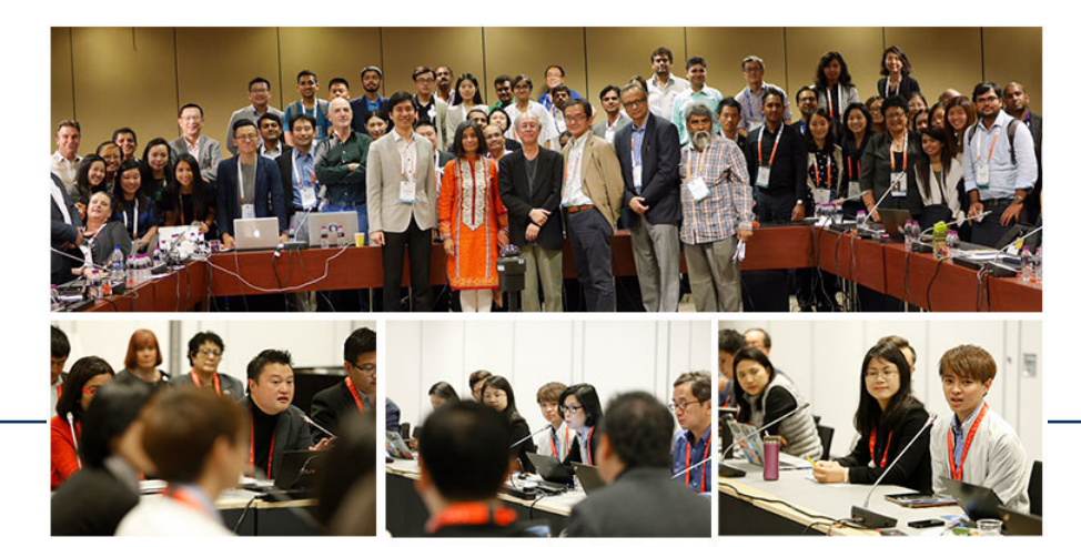
APAC Space face-to-face meeting with community members