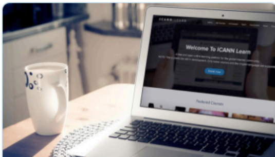
Getting Started with ICANN Learn