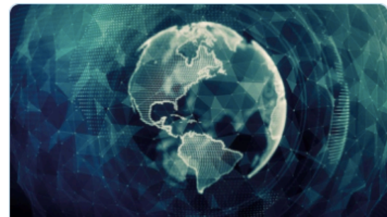
Digital Trade and Global Internet

Videos from the ICANN and USC Annenberg Spring