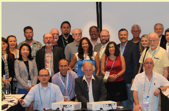
NARALO members at ATLAS 2 in June 2014 during ICANN50 in London

NARALO is composed of At-Large Structures (ALSes) that meet online once a month (second Monday) and face-to-face at ICANN and General Assembly meetings. Our members hail from the United States, Canada and Puerto Rico and speak English, French and Spanish. ICANN offers fellowships to participants to attend ICANN Public Meetings so we can have a diversity of voices.