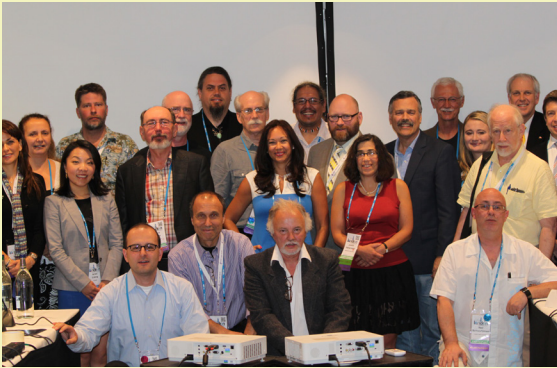
NARALO members at ATLAS 2 in June 2014 during ICANN50 in London

NARALO is composed of At-Large Structures (ALSes) that meet online once a month (second Monday) and face-to-face at ICANN and General Assembly meetings. Our members hail from the United States, Canada and Puerto Rico and speak English, French and Spanish. ICANN offers fellowships to participants to attend ICANN Public Meetings so we can have a diversity of voices.