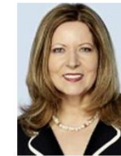
Erika Mann Europe