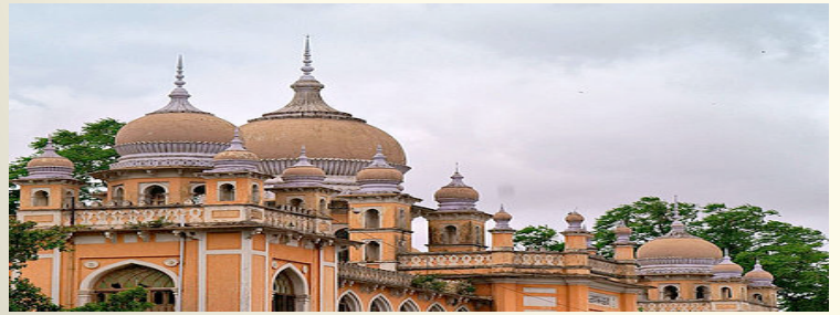
What does ALAC Do?