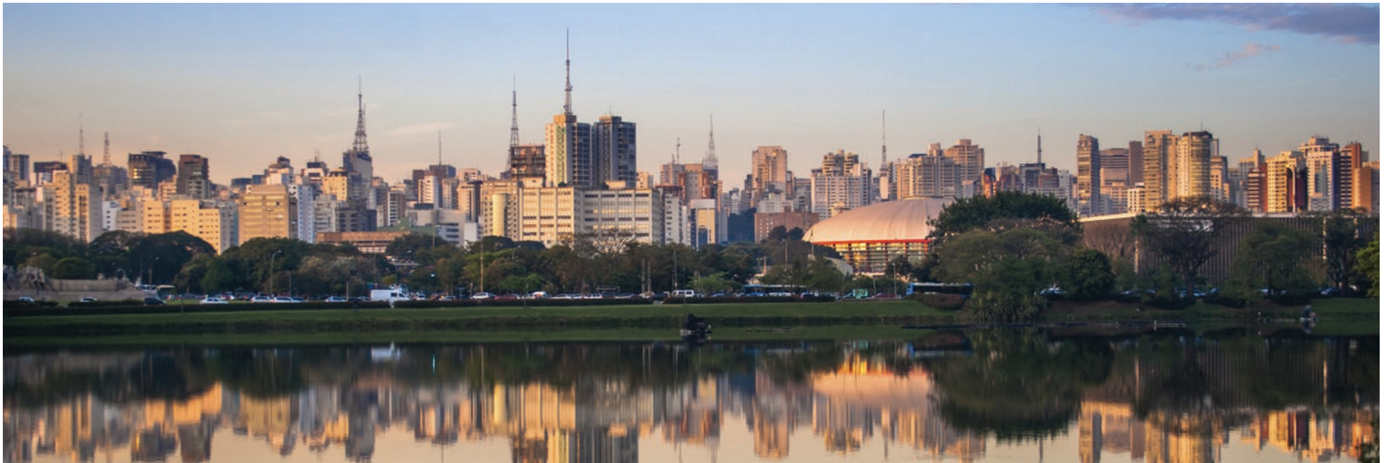
São Paulo, Brazil, host of regional events in 2015