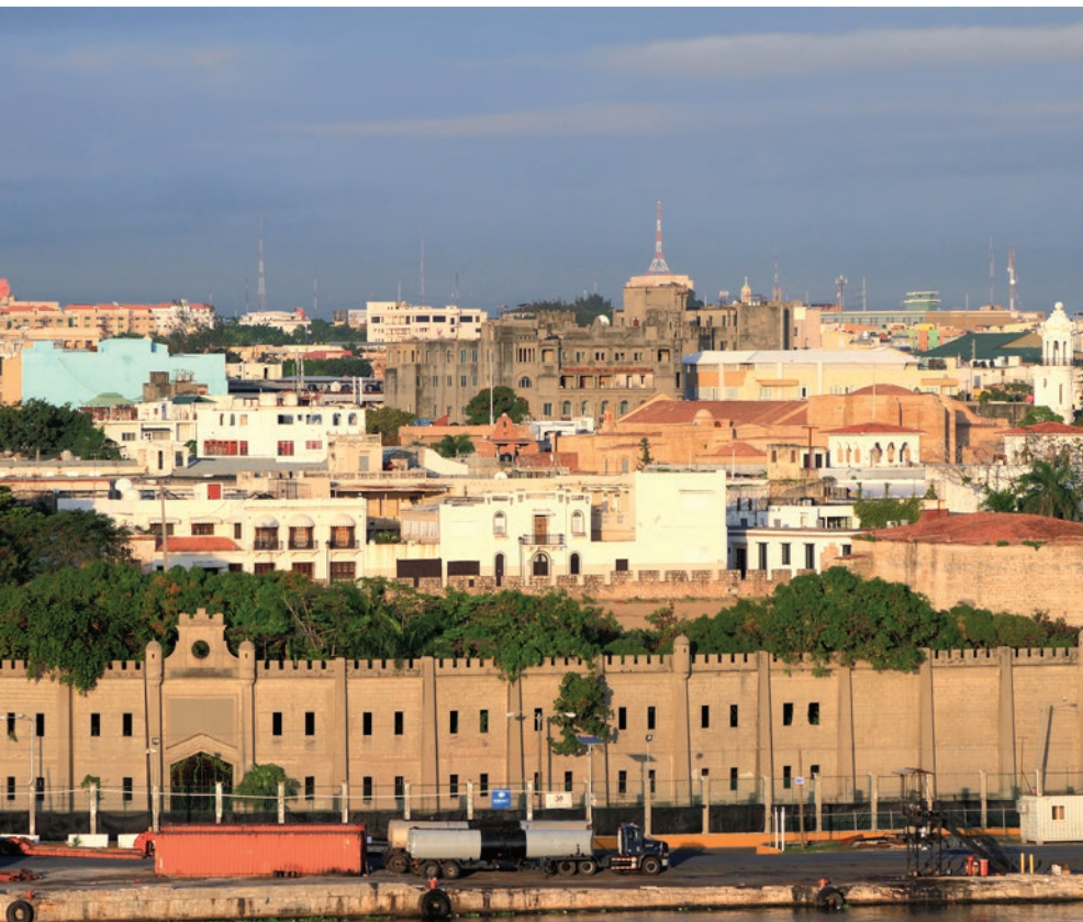
Santo Domingo, Dominican Republic, host of regional events in 2015