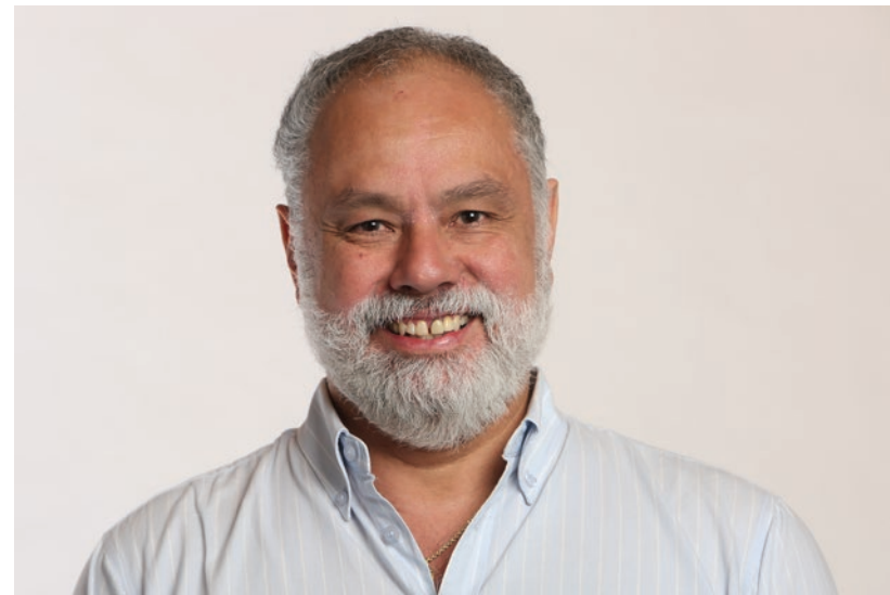
Lito Ibarra, ICANN Board Member

The presentation of these activities, and the results they generated, serves not only as historical account, but also as motivation to those in the region for continued involvement, whether by organizing local events, contributing to the development of the LAC Strategic Plan, or simply acknowledging the hard work and dedication of other community members.