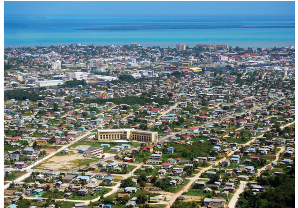
Belize, host of regional events in 2015

These sentiments have been expressed on several occasions by government ministers, Internet Service Providers, civil society members, and even by organizations such as OOCUR and CTU. Many regional organizations have even requested ICANN to return to their events, on an ongoing basis, to engage in capacity-building activities with their members.