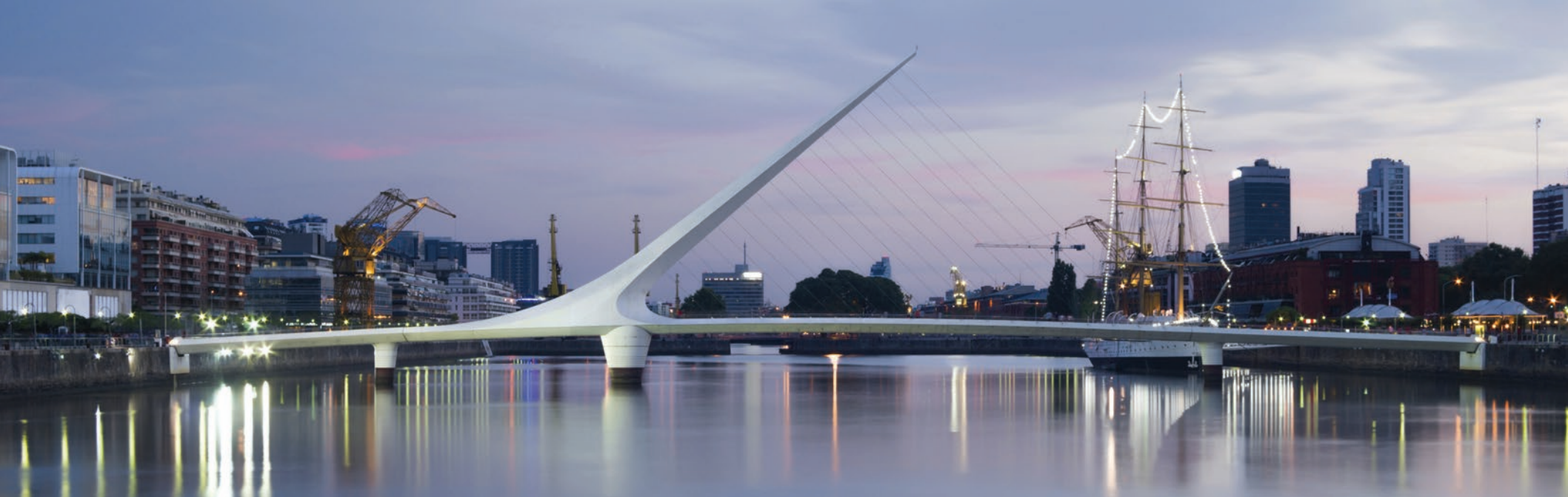
Buenos Aires, Argentina, host of regional events in 2015