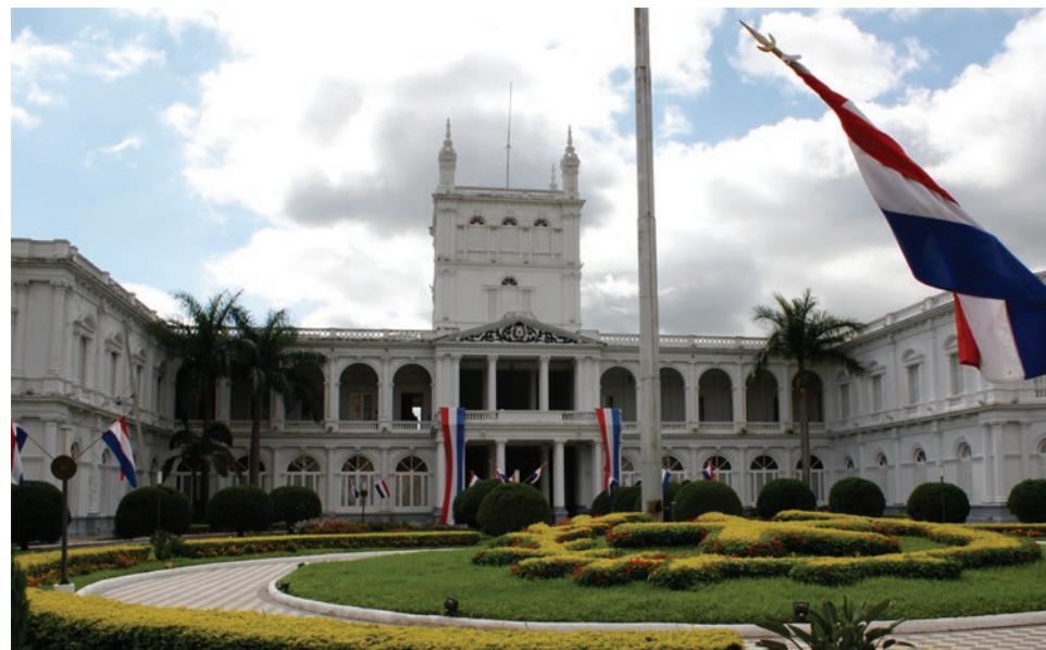
Asunción, Paraguay, host of regional events in 2015

Muito Obrigado (thank you very much) to the entire Brazilian community for this fantastic 2015, and we are looking forward to an even more productive 2016!