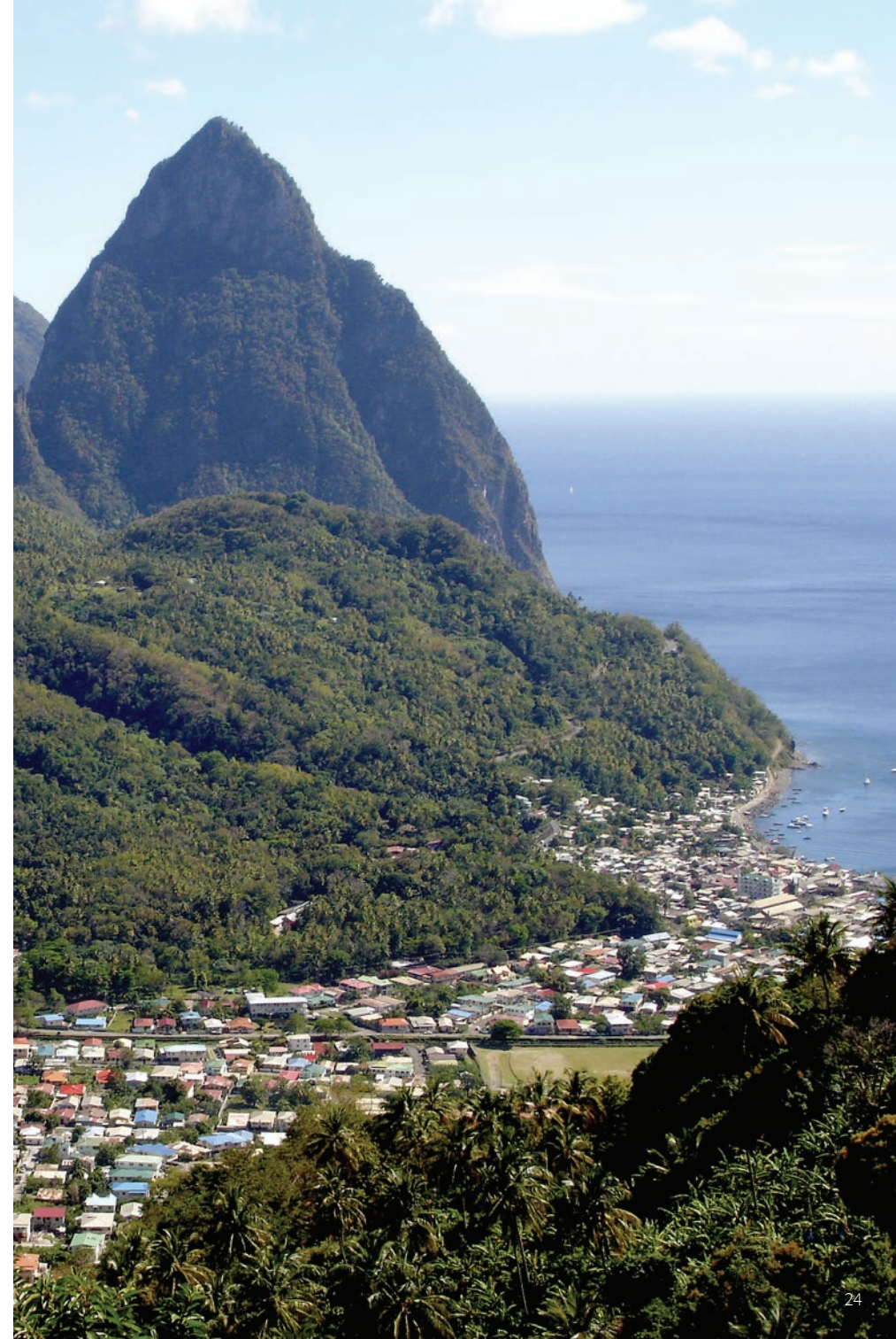
Saint Lucia, host of regional events in 2015