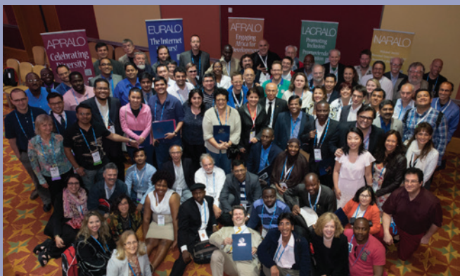
Members of the At-Large community at the Second At-Large Summit held in London in June 2014.

The five RALOs unite our ALSes and independent members based on their geographic regions, namely Africa (AFRALO), Asia, Australasian and Pacific Islands (APRALO), Europe (EURALO), Latin America and the Caribbean Islands (LACRALO), and North America (NARALO). As the communication forum and coordination point, the RALOs promote and assure the participation of regional Internet user communities within ICANN activities as well as enhance knowledge and capacity building. RALOs also form various internal working groups for their ALSes and independent members in their regions to collaborate on issues ranging from policy development to Internet governance. Each RALO is governed by its own organizing documents, including a memorandum of understanding with ICANN. Playing a key role in ICANN's regional strategies, several RALOs partner with ICANN's Global Stakeholder Engagement team to facilitate the development of critical infrastructure for the Domain Name System.