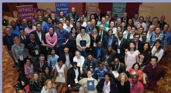
Members of the At-Large community at the Second At-Large Summit held in London in June 2014.

EURALO is governed by our own organizing documents, including a memorandum of understanding with ICANN. Playing a key role in ICANN's regional strategies, EURALO partners with ICANN's Global Stakeholder Engagement team to raise awareness of the critical infrastructure for the Domain Name System.