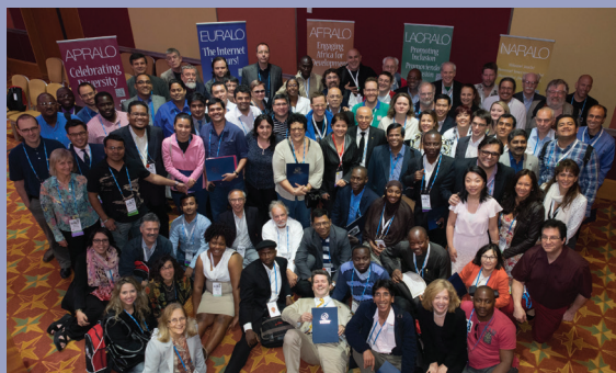
Members of the At-Large community at the Second At-Large Summit held in London in June 2014.

EURALO is governed by our own organizing documents, including a memorandum of understanding with ICANN. Playing a key role in ICANN's regional strategies, EURALO partners with ICANN's Global Stakeholder Engagement team to raise awareness of the critical infrastructure for the Domain Name System.