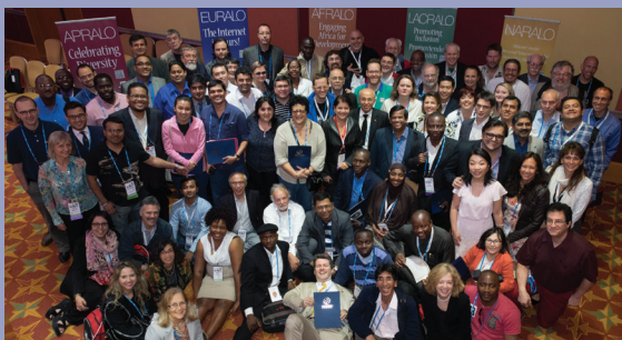
Members of the At-Large community at the Second At-Large Summit held in London in June 2014.

Each RALO is governed by its own organizing documents, including a memorandum of understanding with ICANN. Playing a key role in ICANN's regional strategies, EURALO partners with ICANN's Global Stakeholder Engagement team to raise awareness of the critical infrastructure for the Domain Name System.