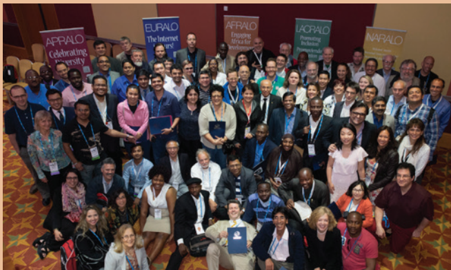
Members of the At-Large community at the Second At-Large Summit held in London in June 2014.

Five RALOs unite our ALSes and independent members based on their geographic regions, namely Africa (AFRALO), Asia, Australasian and Pacific Islands (APRALO), Europe (EURALO), Latin America and the Caribbean Islands (LACRALO), and North America (NARALO). As the communication forum and coordination point, the RALOs promote and assure the participation of regional Internet user communities within ICANN activities as well as enhance knowledge and capacity building. RALOs also form various internal working groups for their ALSes and independent members in their regions to collaborate on issues ranging from policy development to Internet governance. Each RALO is governed by its own organizing documents, including a memorandum of understanding with ICANN. Playing a key role in ICANN's regional strategies, several RALOs partner with ICANN's Global Stakeholder Engagement team to facilitate the development of critical infrastructure for the Domain Name System.