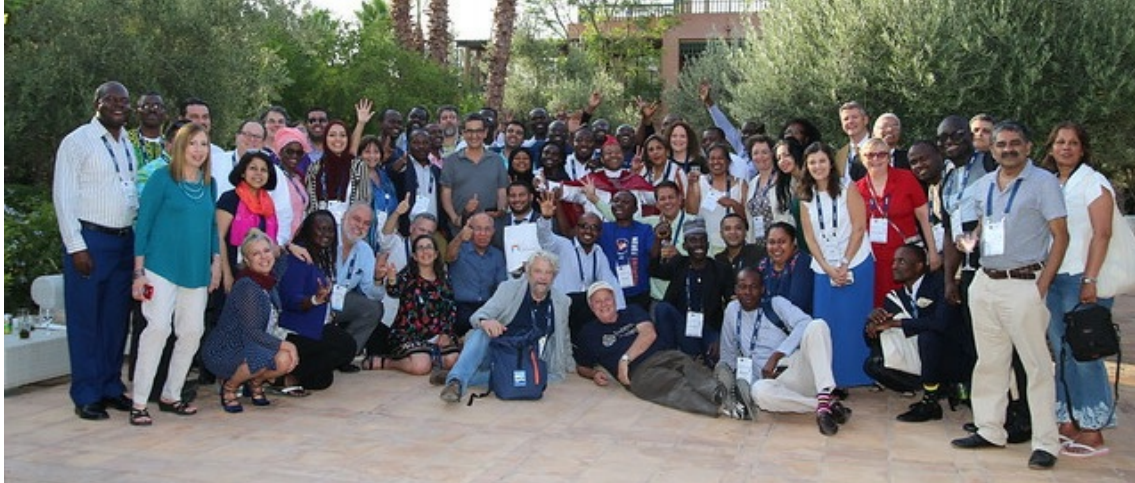
ISOC Chapters during ICANN65 Policy Forum in Marrakech.

ISOC Chapters present at ICANN65 held a networking session with approximately 60 members including reps from many of the NARALO ALSes, including ISOC Chapters from NY, San Francisco Bay Area, Washington D.C., Quebec and Canada.