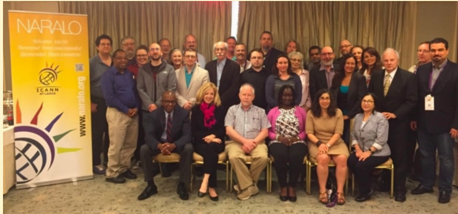
2017 NARALO General Assembly (GA) during ARIN in New Orleans, Louisiana.

Video: The 11-Year Anniversary of NARALO @ ICANN61 in San Juan, Puerto Rico