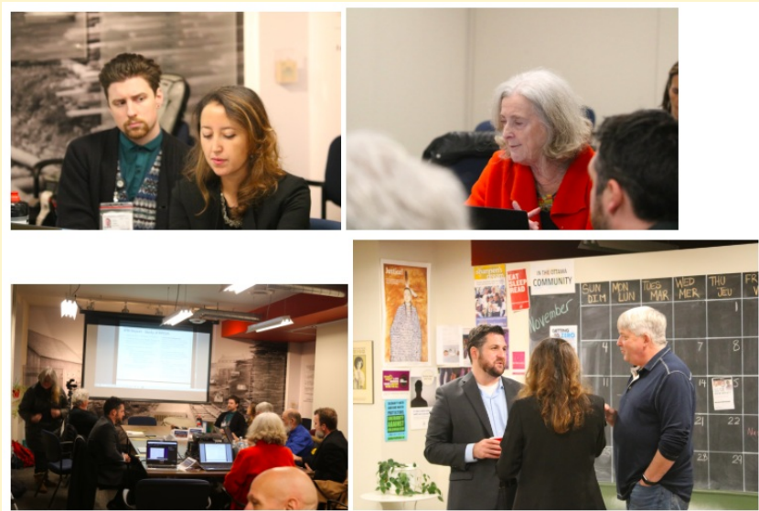
ICANN63 Readout in Ottawa, Canada