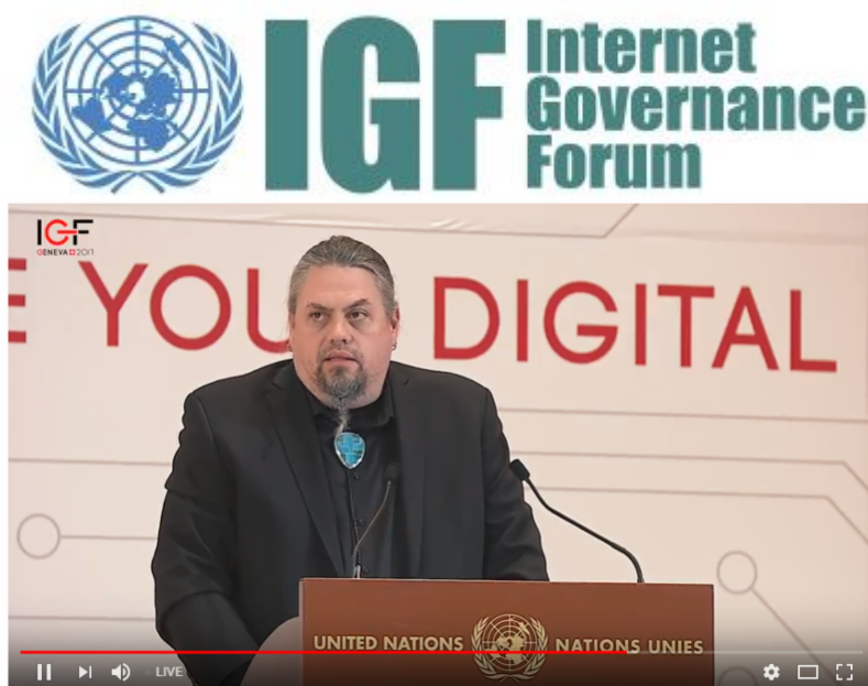
IGF2017 - Day 4 - Assembly Hall - Closing Ceremony - English