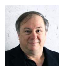
Zurich, Switzerland International Fellow & Lecturer | University of Zurich Non-Commercial Stakeholder Group/Non-Commercial Users Constituency