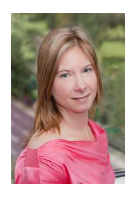
Melbourne, Australia Deputy Dean, Academy of Law | Australian Catholic University Intellectual Property Constituency