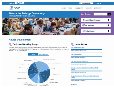
New At-Large Website

Council, and one member of the Country Code Names Supporting Organization (ccNSO) Council. Apply for these positions by completing the online application or by emailing nomcom2016@icann.org . All applications are confidential and should be received by 20 March 2016 (23:59 UTC) for full consideration. Selections will be announced in August or September 2016.