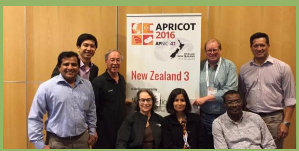
ICANN Board and staff at APRICOT 2016