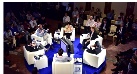
Panel discussion at Cyber3 Conference