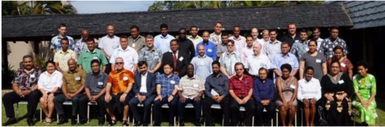
ITU-CoE PITA Telecoms Strategy Study Workshop

aspect with regard to Internet identifiers and the best current practices in handling abuses and misuse. Together with Asia Pacific Network Information Centre (APNIC), Champ also helped to deliver the Internet Abuse Handling Workshop and Network Security Workshops.