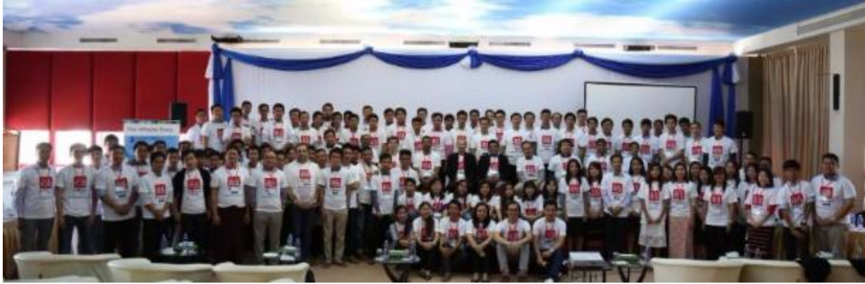
Participants at the Myanmar Network Operators Group Conference