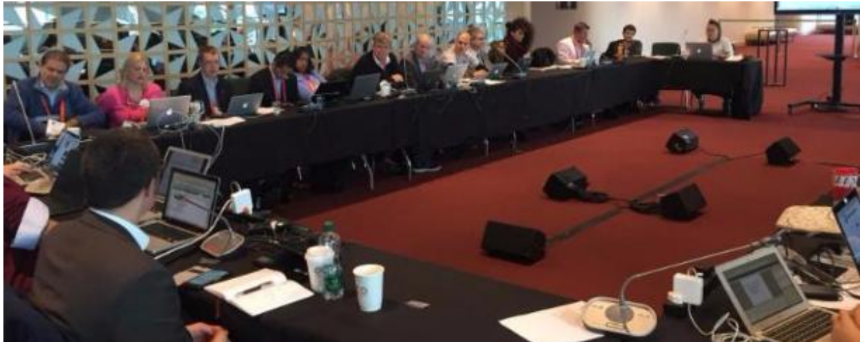
Increasing global civil society engagement and participation