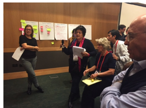
ALAC Activities at ICANN54

The ALAC unanimously passed statements on the Use of Country and Territory Names as Top-Level Domains on the New gTLD Auction Proceeds Discussion Paper for communication to the relevant parties. The ALAC also held a successful first Development Session on 23 October 2015 to welcome new members.