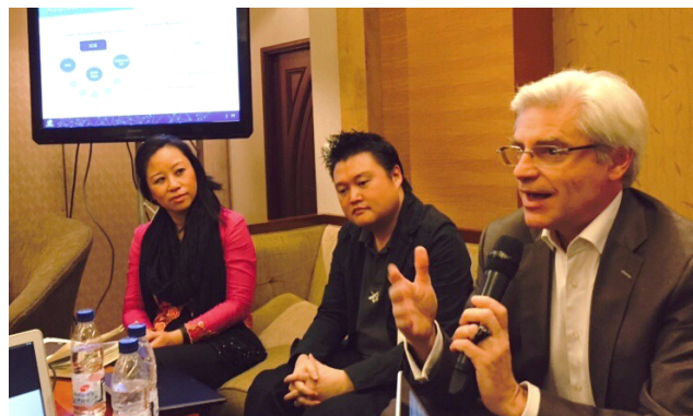
Panel discussion on IANA Stewardship Transition at RightsCon

RightsCon Southeast Asia was held in Manila, the Philippines from 24-25 March 2015. The RightsCon Summit series – well known in the Silicon Valley since 2011 – has become a key event convened around the issue of an open internet. In Manila, the event brought together some 600 experts from governments, business and civil society all over the world to discuss digital rights and the need to maintain a free and open Internet. As ICANN's mission is to support a free and open Internet that is safe, secure and resilient, we are proud to support RightsCon in Southeast Asia, and organised a session on the IANA Stewardship Transition there as well.