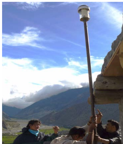
Deployment of a community-based Hybrid Wireless Network using TV white space and Wi-Fi spectrum in remote valleys around Manaslu Himalaya in Nepal.

We're proud to partner with the community in supporting regional Information Communications Technology (ICT) development, through the Information Society Innovation Fund ( ISIF Asia ). Five winning projects have been announced for the 2015 grants – they include innovative uses of Internet technologies to support communities in Bangladesh through telemedicine, and low cost deployment of wireless networks in Nepal and Vanuatu. Read more .