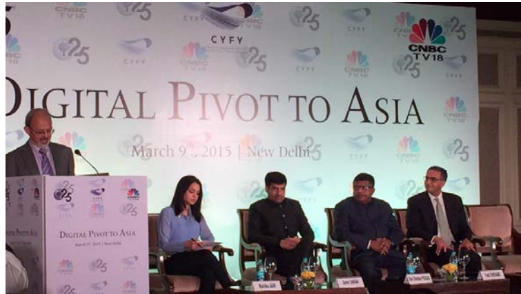
Panel session at Digital Pivot to Asia

ICANN President and CEO Fadi Chehadé was in Delhi, India on 9 - 10 March 2015 to meet different stakeholders from government, business, academia and civil society.