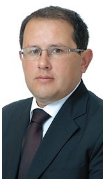
Editorial by Rodrigo Saucedo