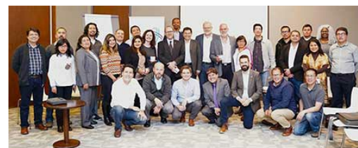
Participants at the GFCE workshop in La Paz, Bolivia

Background: On 5 August, LAC Internet stakeholders gathered in La Paz, Bolivia, for a capacity building workshop aimed at creating a more trusted Internet experience in the region. The Global Forum for Cyber Expertise (GFCE) is a global platform where countries, international organizations, and private companies can exchange best practices and expertise on cyber capacity building. The aim of the GFCE Triple-I event is to identify successful policies, practices, and ideas to improve Internet Infrastructure.