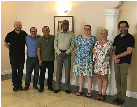
ICANN LAC team gathers in Saint Lucia for the regional all-hands meeting.