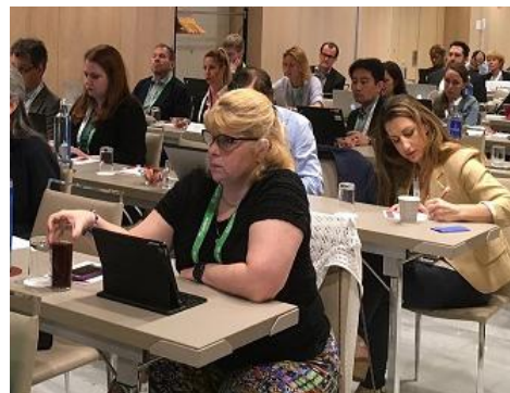
GDD Summit 2017 participants listen in on one of the many Registry breakout sessions.

The summit provided a forum for ICANN's contracted parties to discuss issues of mutual interest and importance, share best practices and meet one-on-one with members of the ICANN organization.