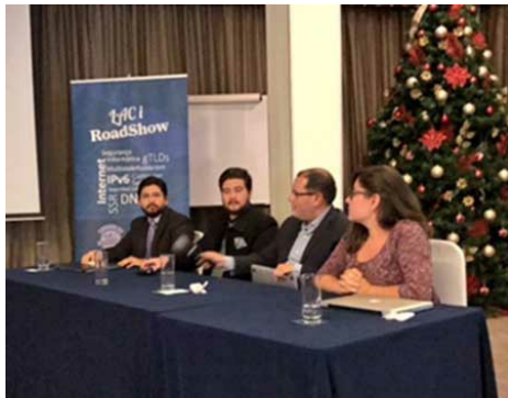
Panelists of the 2016 Andean Region edition of the LAC-i-Roadshow in Quito, Ecuador