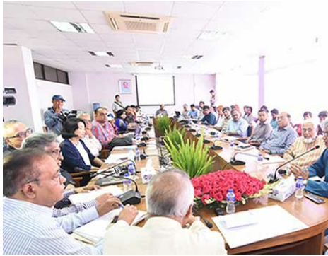
NBGP meeting at the Bangla Academy in Dhaka in Bangladesh.