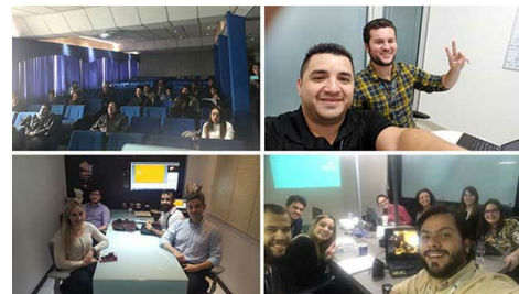
Remote participation hubs in Mexico, Bolivia, and Brazil