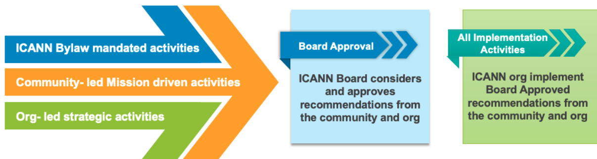
Figure 1: ICANN Org Implementation Activities

The scope of activities to be included in this prioritization process as a step in the annual planning process is the Board-approved org implementation work, such as Policy Development Process (PDP) recommendations, Specific Review recommendations, and the implementation of other nonpolicy and advice work.