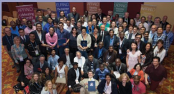
Members of the At-Large community at the Second At-Large Summit held in London in June 2014.

EURALO is governed by our own organizing documents, including a memorandum of understanding with ICANN. Playing a key role in ICANN's regional strategies, EURALO partners with ICANN's Global Stakeholder Engagement team to raise awareness of the critical infrastructure for the Domain Name System.