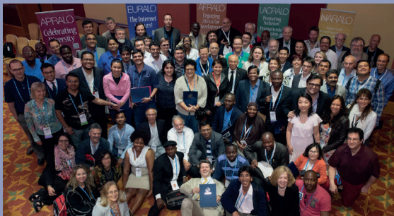
Members of the At-Large community at the Second At-Large Summit held in London in June 2014.

EURALO is governed by our own organizing documents, including a memorandum of understanding with ICANN. Playing a key role in ICANN's regional strategies, EURALO partners with ICANN's Global Stakeholder Engagement team to raise awareness of the critical infrastructure for the Domain Name System.