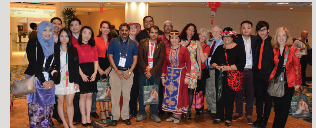
Members of APRALO and At-Large support staff at ICANN52 in Singapore.

APRALO works closely with the ICANN Asia Pacific (APAC) Hub Team in Singapore. A member of the ICANN Global Stakeholder Engagement Team supports APRALO by facilitating the development of critical infrastructure for the DNS. APRALO encourages its members to participate in public consultation activities to support the work of the ALAC.