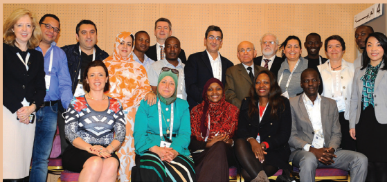
AFRALO members and At-Large community members at the ICANN55 Meeting in Marrakesh, March 2016.

Through an extensive outreach campaign, several At Large Structures (ALSes) have joined AFRALO in recent years. More than 44 ALSes representing 25 countries from the African region make up AFRALO. The At Large Structures are either Non Governmental Organizations or associations representing local Internet users or ICT activists in general. They are involved in Capacity building for underprivileged communities, promotion of free and open source software, development of culture, health, environment, and in general Human development in the continent making use of Internet in their activities.