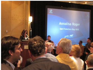
NARALO Showcase in San Francisco