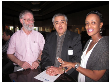
The Chapter held monthly meetups in San Francisco