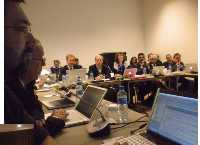
Global Internet Society Chapter Delegates Meeting, Bruxelles, Belgium 2010