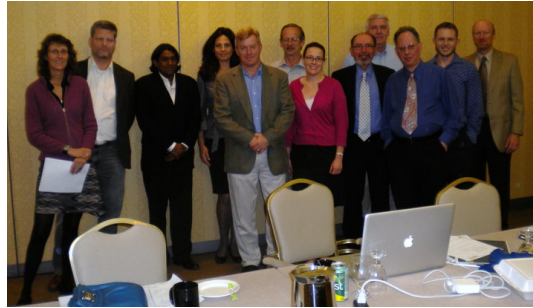
North American Internet Society Chapter Delegates Workshop in Reston, Virginia April 30, 2010