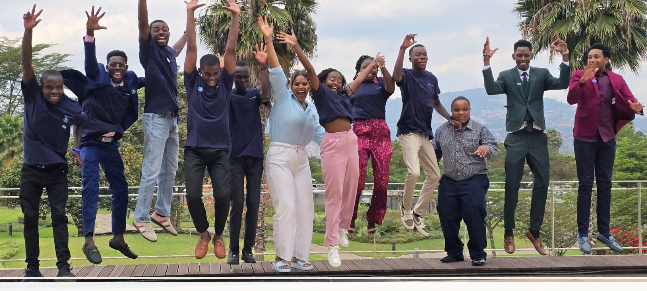
NextGen group – ICANN80