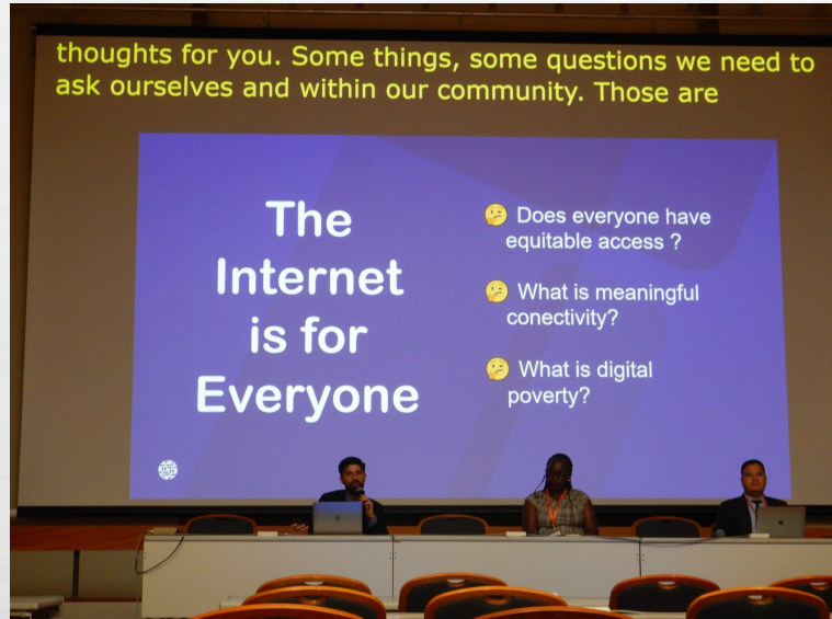
UN IGF Kyoto 2023 (WS #483 Future-Ready Education)