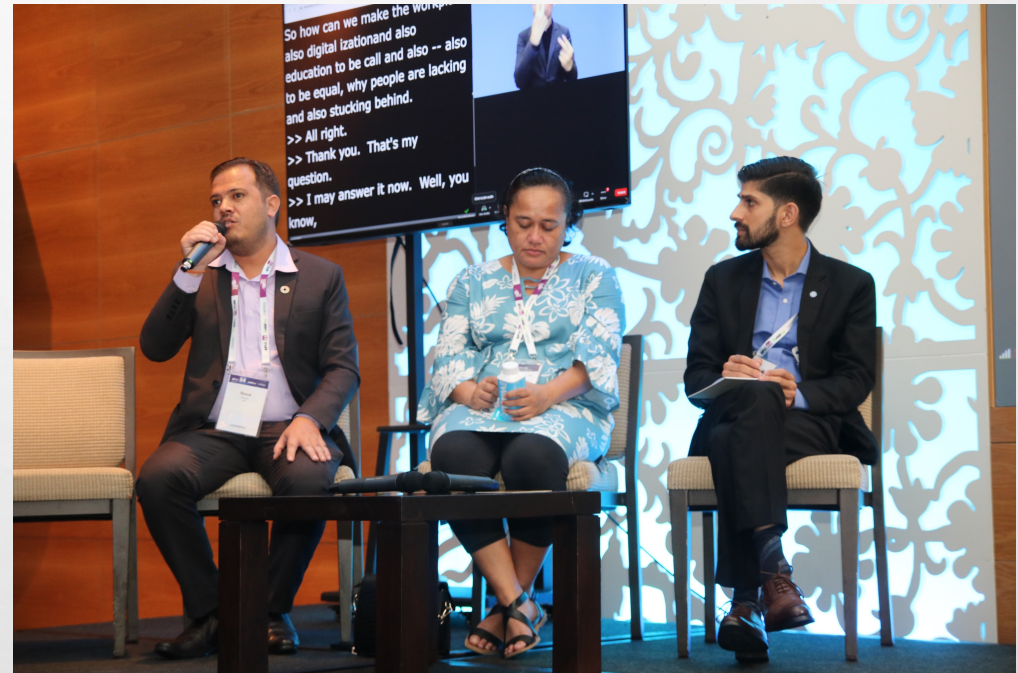
APriGF Singapore 2022 (Session 05 Resiliency and Inclusivity in Digital Education)