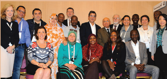
AFRALO members and At-Large community members at the ICANN55 Meeting in Marrakesh, March 2016.

Through an extensive outreach campaign, several At Large Structures (ALSes) have joined AFRALO in recent years. More than 44 ALSes representing 25 countries from the African region make up AFRALO. The At Large Structures are either Non Governmental Organizations or associations representing local Internet users or ICT activists in general. They are involved in Capacity building for underprivileged communities, promotion of free and open source software, development of culture, health, environment, and in general Human development in the continent making use of Internet in their activities.