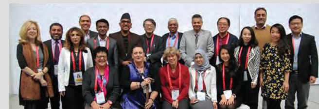
APRALO members and At-Large staff at ICANN58 in Copenhagen

APRALO works closely with the ICANN Asia Pacific (APAC) Hub Team in Singapore. A member of the ICANN Global Stakeholder Engagement Team supports APRALO by facilitating the development of critical infrastructure for the DNS. APRALO encourages its members to participate in public consultation activities to support the work of the ALAC.