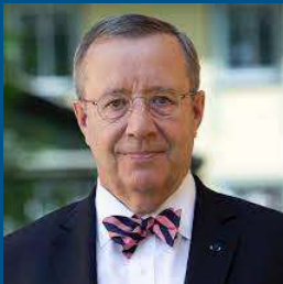
Toomas Hendrik Ilves