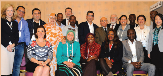
AFRALO members and At-Large community members at the ICANN55 Meeting in Marrakesh, March 2016.

Through an extensive outreach campaign, several At Large Structures (ALSes) have joined AFRALO in recent years. More than 44 ALSes representing 25 countries from the African region make up AFRALO. The At Large Structures are either Non Governmental Organizations or associations representing local Internet users or ICT activists in general. They are involved in Capacity building for underprivileged communities, promotion of free and open source software, development of culture, health, environment, and in general Human development in the continent making use of Internet in their activities.