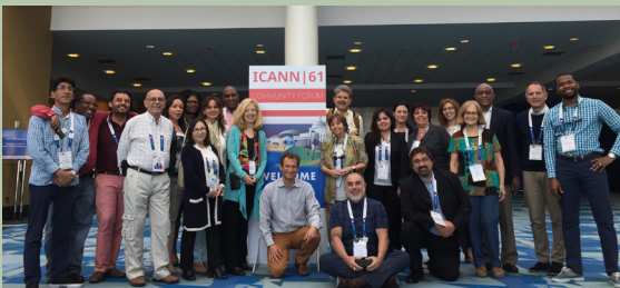
LACRALO members at ICANN61 in San Juan, Puerto Rico.

Our current membership includes over 50 At-Large structures (ALSes) located in 21 countries and territories. Our numbers are growing. The ALSes range from information and communications technology activists to nongovernmental organizations and associations representing local Internet end users. LACRALO is governed by our own organizing documents, including a Memorandum of Understanding with ICANN. LACRALO plays a key role in the development of ICANN's regional strategies. We work jointly with ICANN's Global Stakeholder Engagement team to raise awareness of the critical infrastructure of the Domain Name System.