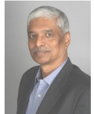
By Satish Babu

Overall, ICANN75 was a very productive meeting for APRALO as the host RALO.