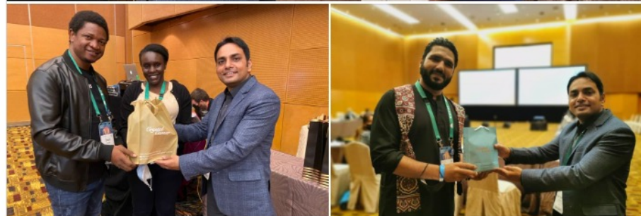
APRALO is at Kuala Lumpur Convention Centre - KLCC. September 22 · Kuala Lumpur, Malaysia · 🌐