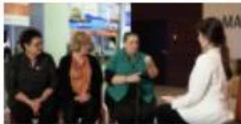
At-Large Review Implementation and Next Steps