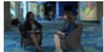
The 11-Year Anniversary of NARALO at ICANN01 (EN)