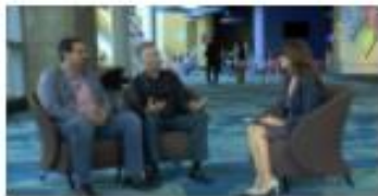
11er Aniversario de NARALO (ES)