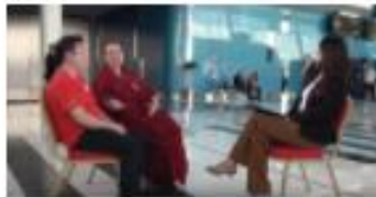
Looking Back at At-Large AfrALO History