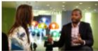
LACRALO Leadership Interview (EN)