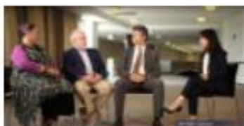
The role of the ALAC explained by past and present chairs