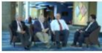
The 11-Year Anniversary NARALO Leadership Interview