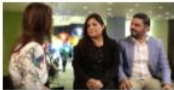
LACRALO Leadership Interview (ES)