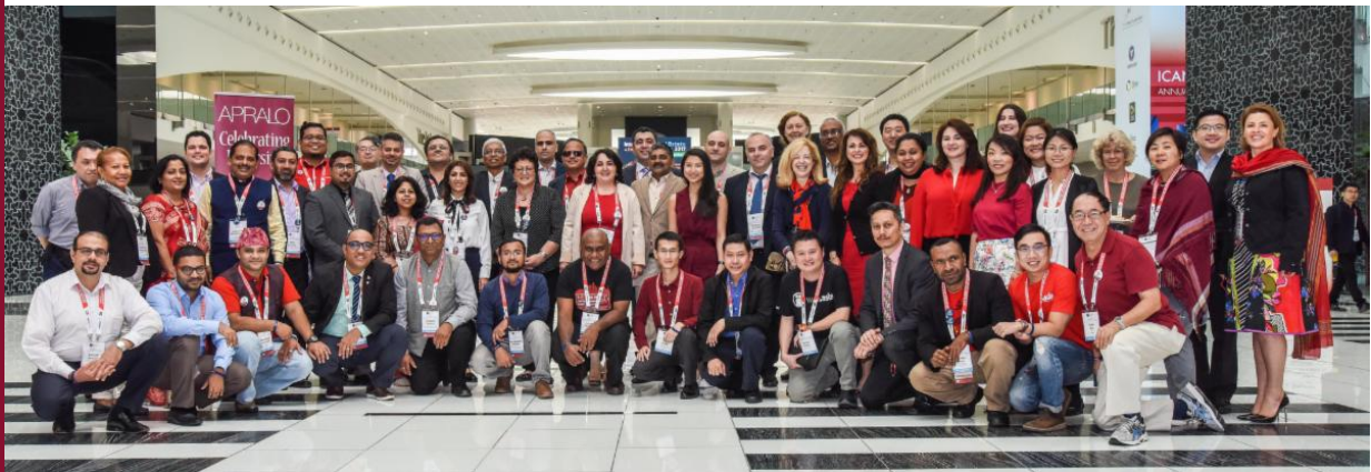
The APRALO family during the ICANN60 Annual General Meeting (AGM) in Abu Dhabi, October 2017.