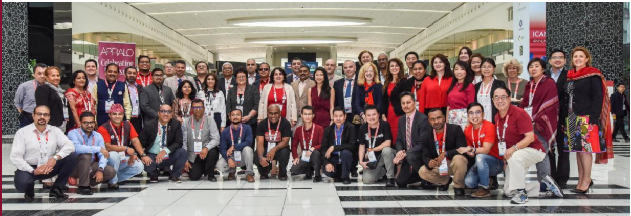
The APRALO family during the ICANN60 Annual General Meeting (AGM) in Abu Dhabi, October 2017.

The July & August editions of the newsletter have been clubbed together.